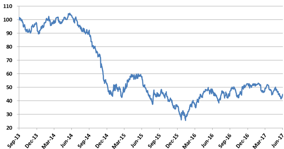
West Texas Oil (WTI) Prices (September 2013 = 100)

“The 5% drop in oil prices between 2Q16 and 2Q17, from USD48.33 to USD46.04 per barrel, was another development that weighed against us in the complicated environment that Pochteca faced in 2017. As we noted in our 4Q16 earnings press release, we had begun to see a recovery in the prices of oil and some petroleum derivatives, but unfortunately those gains were not sustained.”